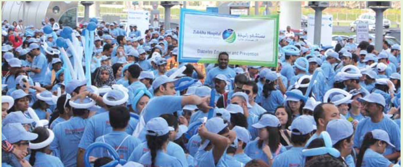
Zulekha Hospital partnered with Landmark Group for their initiative on 'Diabetes Education and Prevention Walk' that was organized by Oasis Centre.