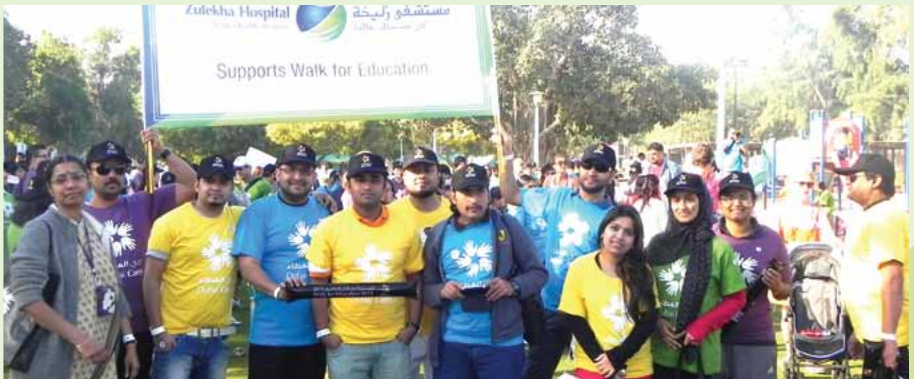
Zulekha Hospital supported the 'Walk for Education' event that was organized by Dubai Cares